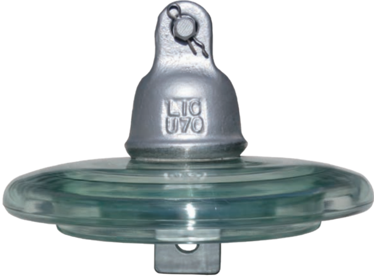
GIG Standard Profile – Tongue & Clevis