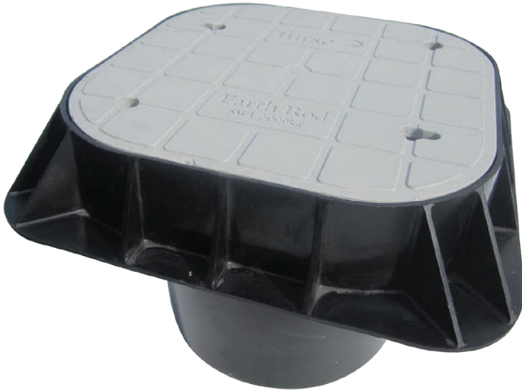
Fulton Earthing Rod Pit