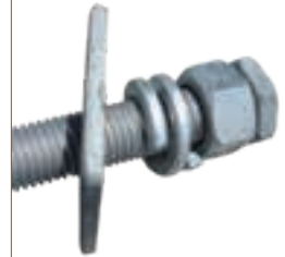
AX STUD FITTINGS = Flat Washer + Helical Spring Washer + Full Nut + Half Nut