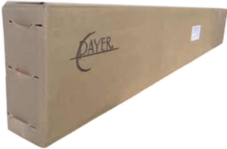
Genuine Payer of Canada