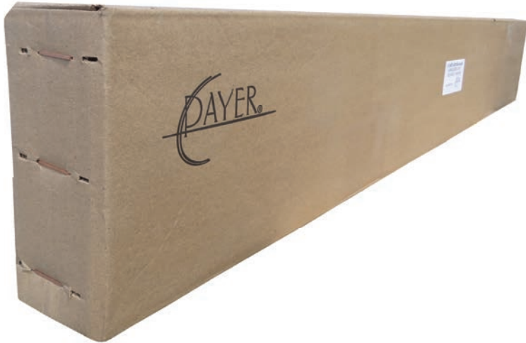
Genuine Payer of Canada