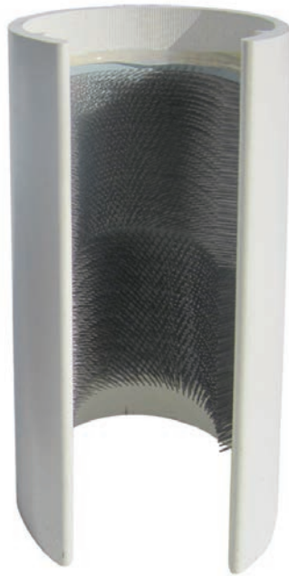
White (for aluminium)