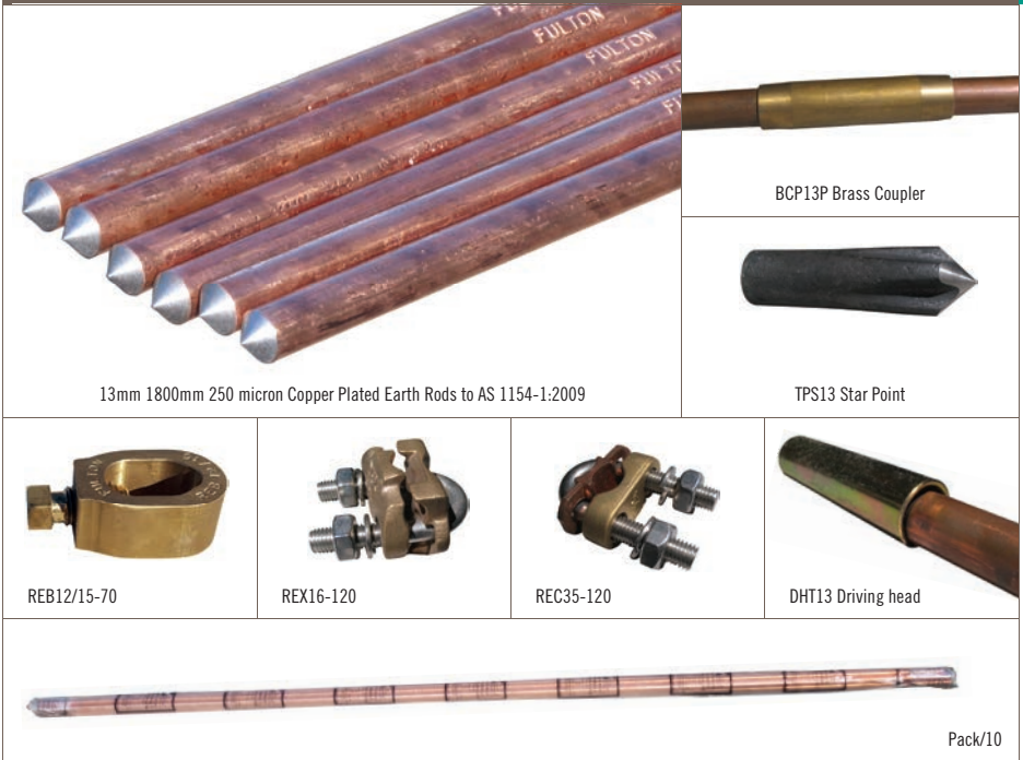
13mm 1800mm 250 micron Copper Plated Earth Rods to AS 1154-1:2009