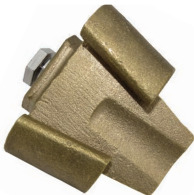
One Size Fits All ECW-1 (25-70mm 2 )