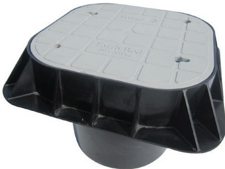
Fulton Earthing Rod Pit