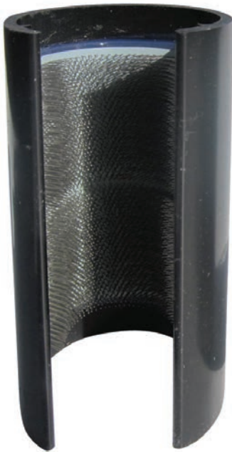
Black (for copper)