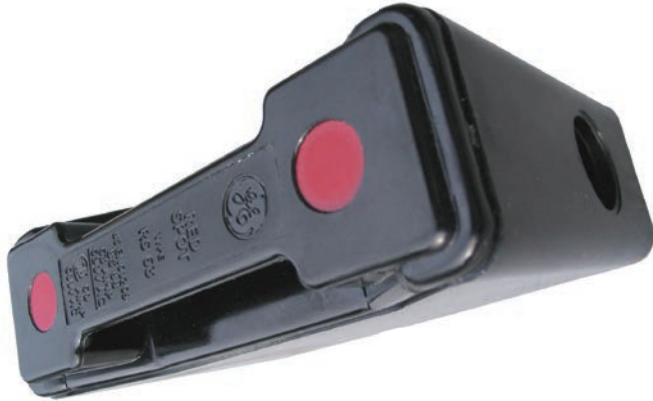
Red Spot Fuseholders now through NZI