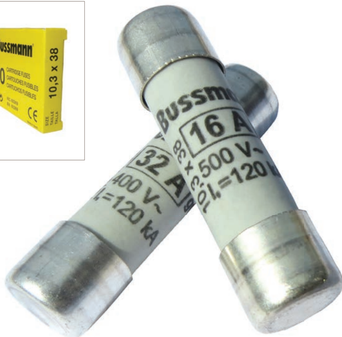
C10G16 and C10G32 10x38