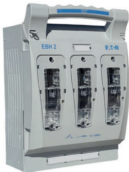
NH00 3P3P Front