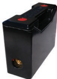
Red Spot RS100H