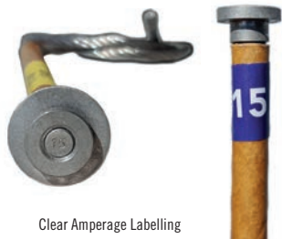
Clear Amperage Labelling