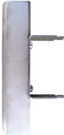
Solid Link Blade