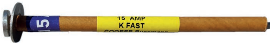
Type K Expulsion Fuselink