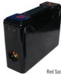
Red Spot RS63H