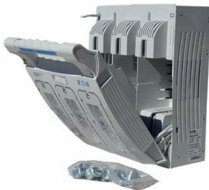
NH1 3P3P Open