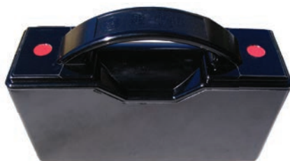
Red Spot RS200H