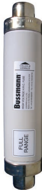
12kV MV Full Range