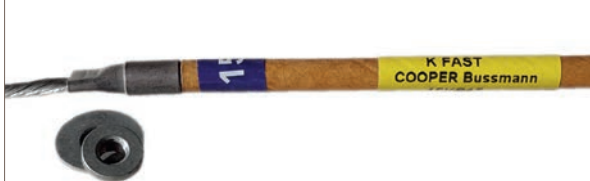
Removable Button Head and Crimped Wiring