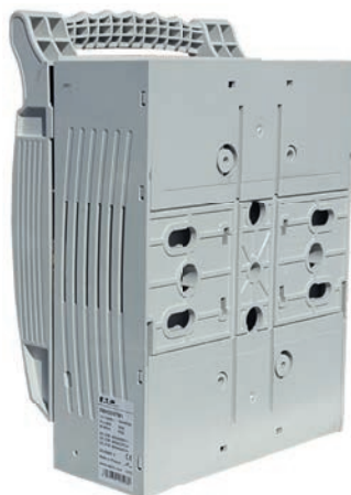
NH00 3P3P Back