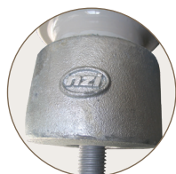
Made in New Zealand