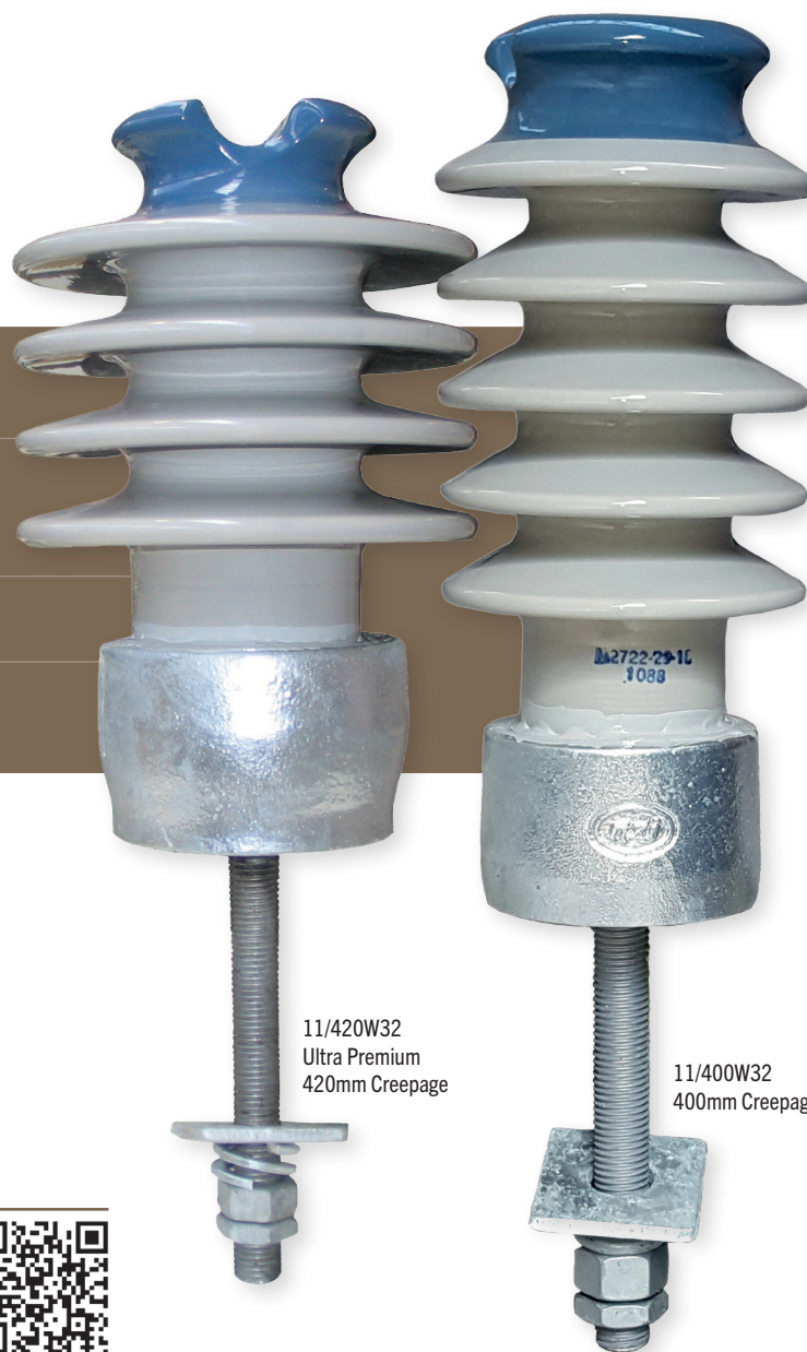
11/420W32 Ultra Premium 420mm Creepage