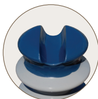
32mm Groove with Radio Silent Glaze