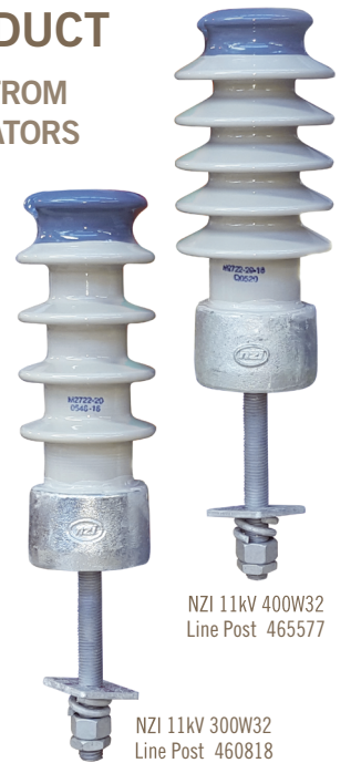
NZI 11kV 400W32 Line Post 465577