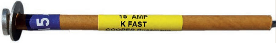
Type K Expulsion Fuse/Link