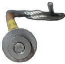
Clear Amperage Labelling