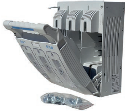
NH1 3P3P Open