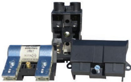
Use BS fuselinks 22mm or 30mm diameter x 57mm long