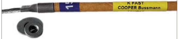
Removable Button Head and Crimped Wiring