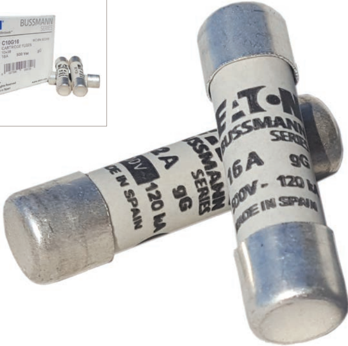
C10G16 and C10G32 10x38