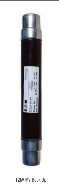
12kV MV Back Up