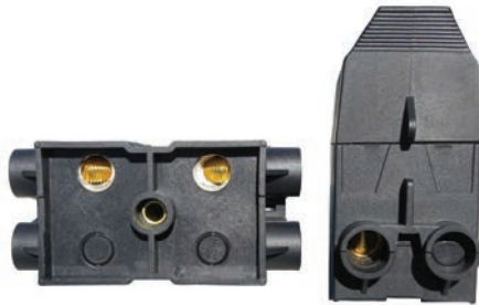
Back Entry or End Entry