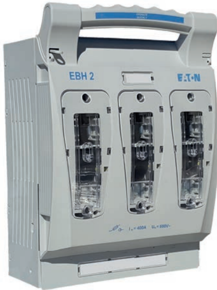
NH00 3P3P Front