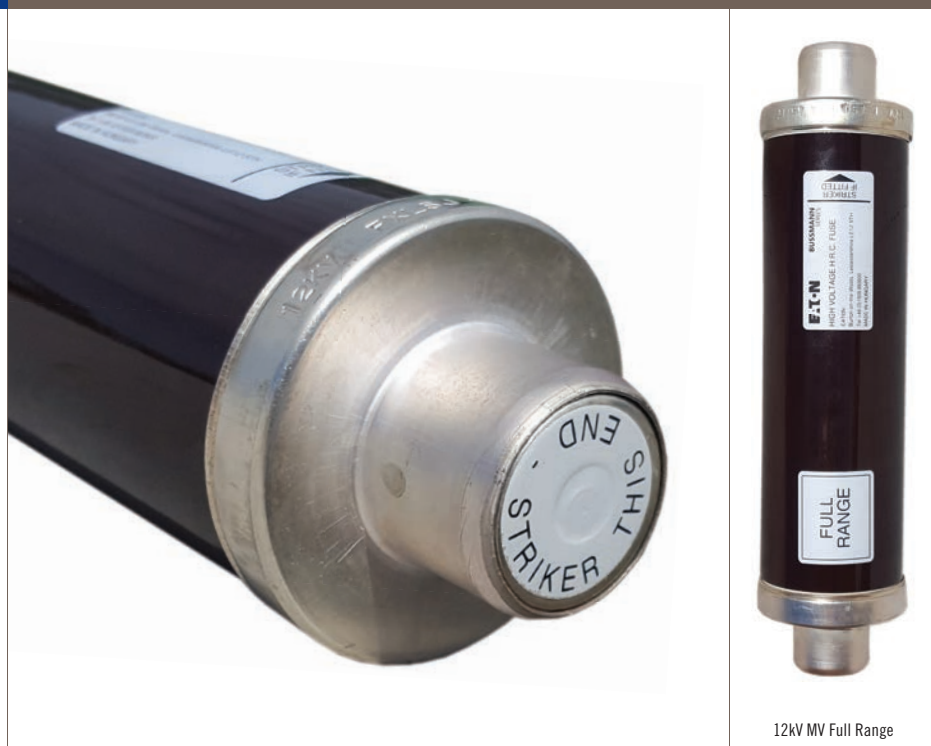
12kV MV Full Range