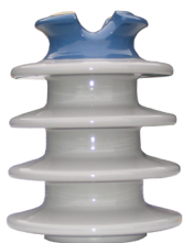
NZI 22kV ALP22/450 Part No. 106941 Made in NZ

The 1930's Depression hit NZI hard but during WW2 NZI was declared an 'essential industry' by the Government and insulator volumes grew quickly.