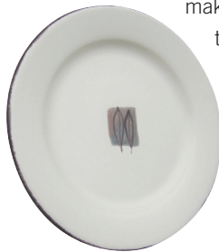
Tekau Dinner Plate Part No. 955604 Made in NZ