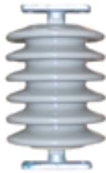
NZI 12kV Standoff T-Insert Part No. 599263 Made in NZ

Thomas Street, PO Box 5, Temuka 7948 South Canterbury, New Zealand Phone +64-3-6150085 Fax +64-3-6158125 Email sales@nzinsulators.co.nz Office Hours 7.30am - 5.00pm weekdays