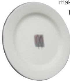
Tekau Dinner Plate Part No. 955604 Made in NZ