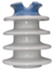
NZI 22kV ALP22/450 Tie Top Pin Type Part No. 106941 Made in NZ

The 1930's Depression hit NZI hard but during WW2 NZI was declared an 'essential industry' by the Government and insulator volumes grew quickly.