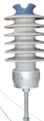
NZI 22kV Ultra Premium Tie Top, Line Post Part No. 464368 Made in NZ