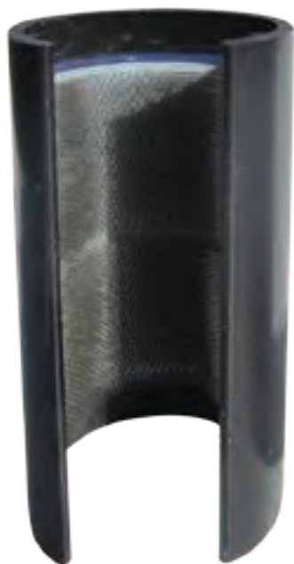
Black (for copper)