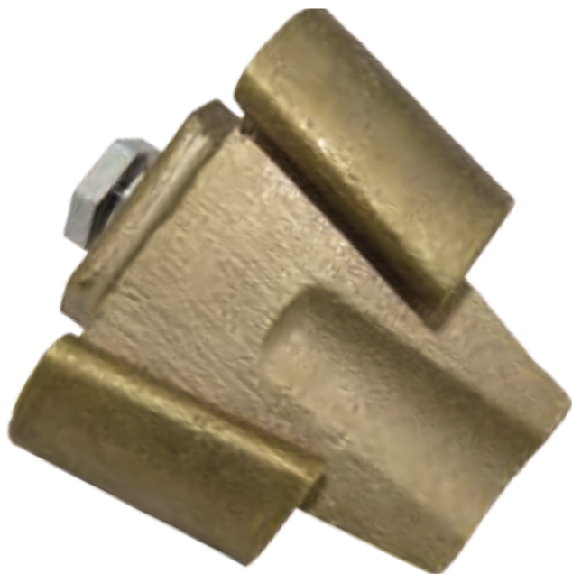
One Size Fits All ECW-1 (25-70mm 2 )