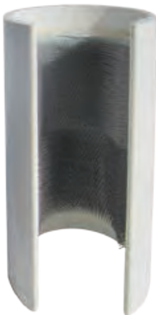
White (for aluminium)