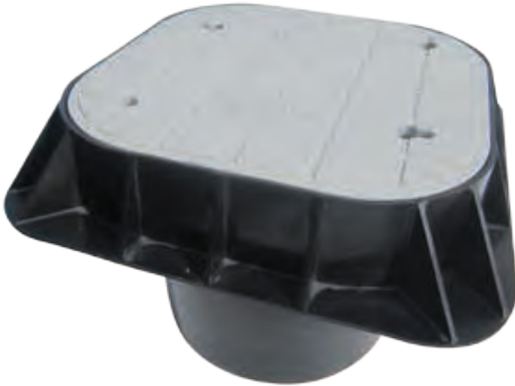
Fulton Earthing Rod Pit