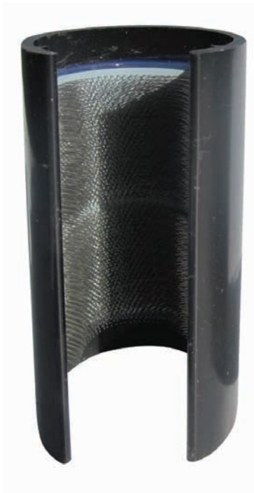
Black (for copper)