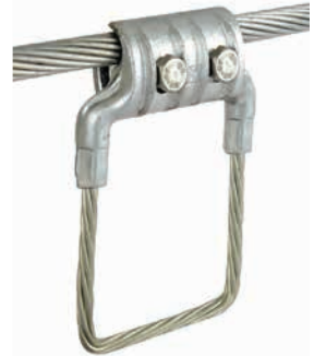
SC2-6/19 Two Bolt