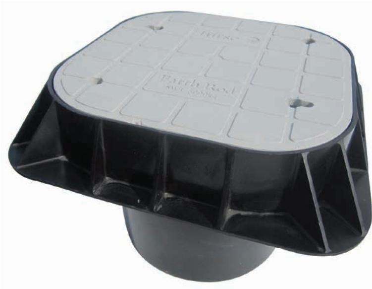
Fulton Earthing Rod Pit