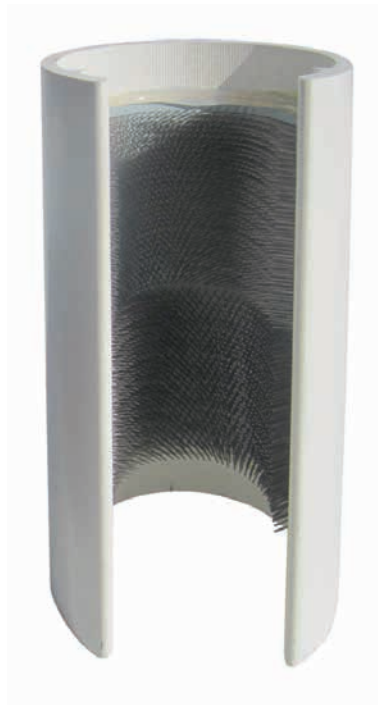
White (for aluminium)