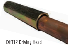
DHT12 Driving Head