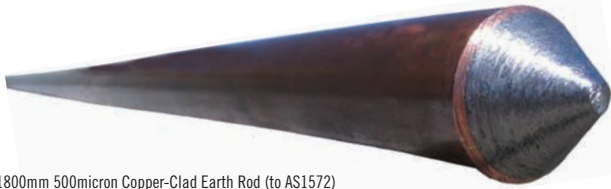
12mm 1800mm 500micron Copper-Clad Earth Rod (to AS1572)