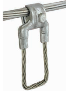
SCI-6/19 One Bolt