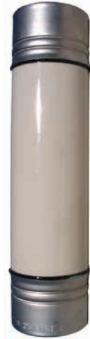
12kV MV Oil