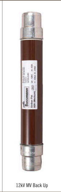
12kV MV Back Up