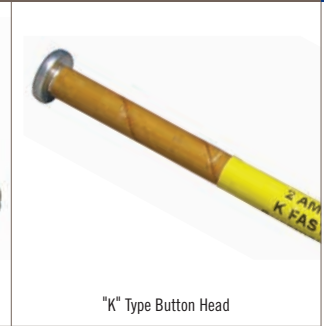
"K" Type Button Head