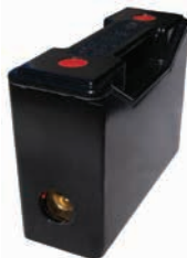
Red Spot RS100H