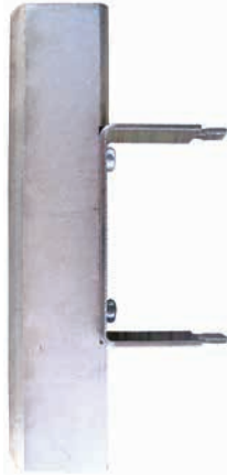
Solid Link Blade