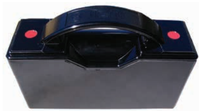
Red Spot RS200H