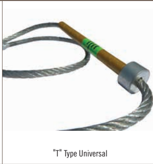
"T" Type Universal