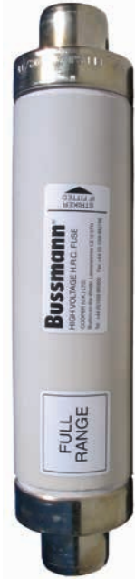
12kV MV Full Range