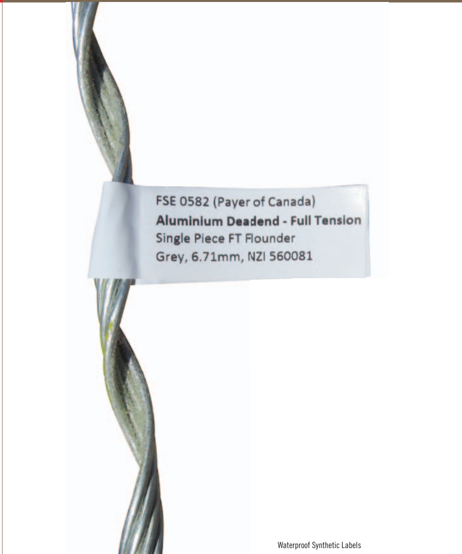
Waterproof Synthetic Labels