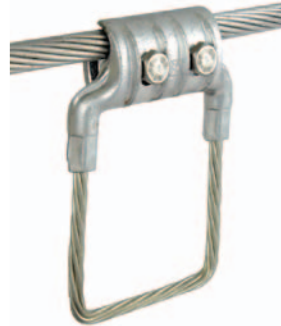
SC2-6/19 Two Bolt