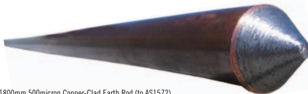
12mm 1800mm 500micron Copper-Clad Earth Rod (to AS1572)