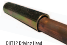
DHT12 Driving Head