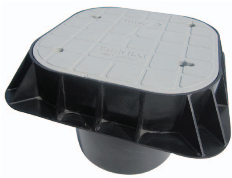
Fulton Earthing Rod Pit