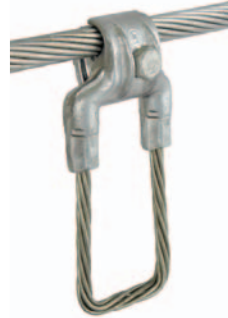
SCI-6/19 One Bolt