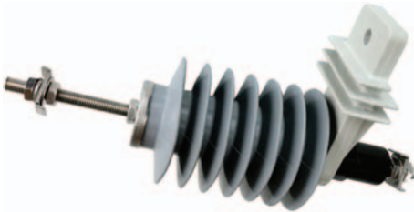
12kV with 100mm Top Fitting (553077)