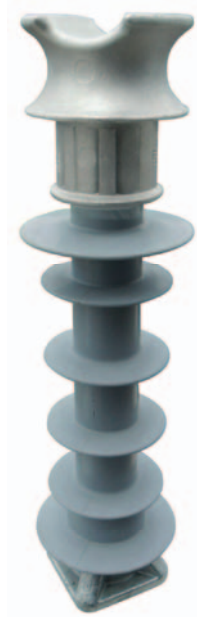
35kV Tie Top Line Post