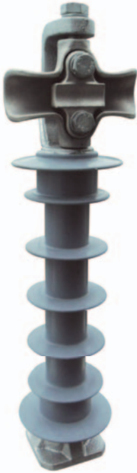
35kV Horizontal Clamp Line Post