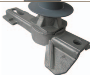
Horizontal Gain Base