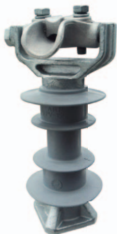
15kV Vertical Clamp Line Post (553093)