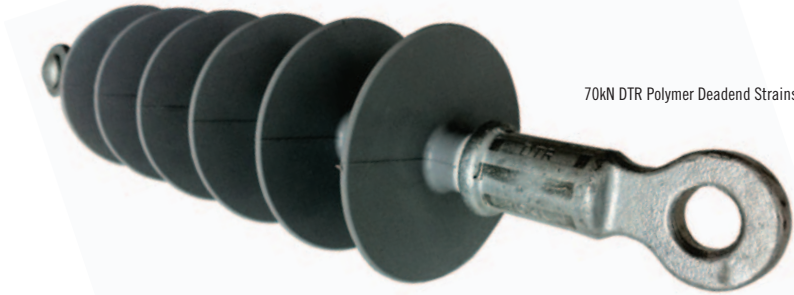
70kN DTR Polymer Deadend Strains