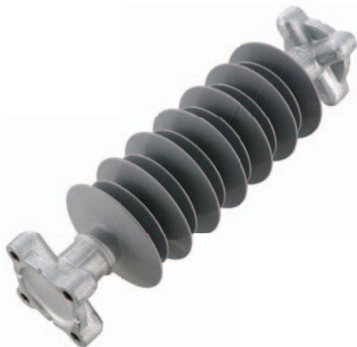
TR208 25kV Station Post