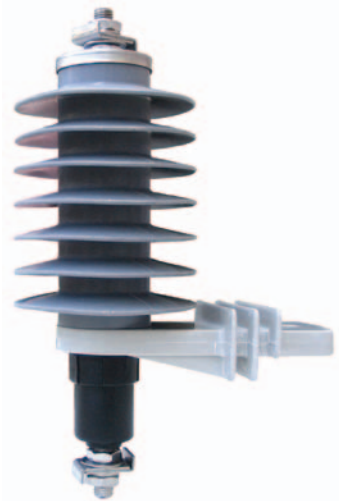
12kV Class 1 (553042)